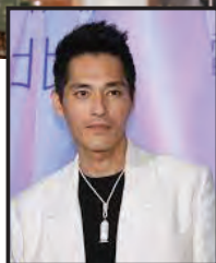
DIRECTOR Blue Lan

* A "cram school" trains its students to pass specific entrance examinations for selective high schools or universities.