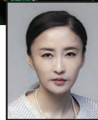
DIRECTOR Yu Li

"THE FALLEN BRIDGE plays like one long exercise in pulling one over on them, a film that subtly touches on the generation gap (high youth unemployment as the economy contracts), the building bubble that their elders contrived to cover up the failings of economic planning and the corruption of the One Party state and those who know how to work that system." - Movie Nation .