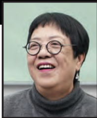
DIRECTOR Ann Hui

Here is an audience member's review with the penname "smile" who says, "A love letter to Hong Kong, Taiwan and China, comprised of poems that are individual love letters to the same. Interviews with and profiles of the poets contextualize their work and enrich one's understanding of their respective cultures. I know this probably sounds dry and boring, but it's really a quietly beautiful movie."